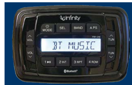
INFINITY™ AUDIO SYSTEM