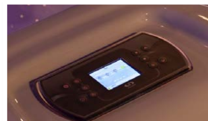
USER FRIENDLY, DIGITAL CONTROLS