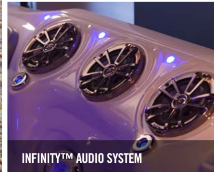
INFINITY™ AUDIO SYSTEM