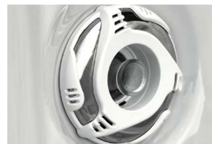
OPTIONAL JET COLOR PACKAGE