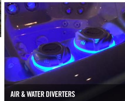
AIR & WATER DIVERTERS