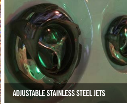
ADJUSTABLE STAINLESS STEEL JETS